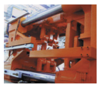
PLASTIC AND RUBBER INJECTION PRESSES