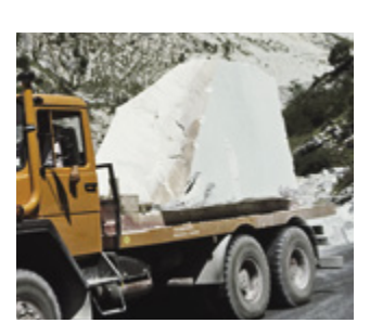
SURFACE TREATMENT MACHINES