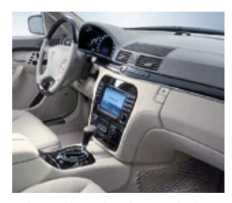
TEST MACHINES FOR AUTOMOTIVE SECTOR