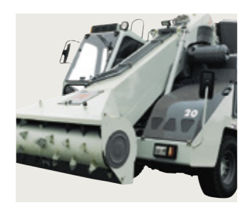
AGRICULTURAL AND EARTH-MOVING MACHINES