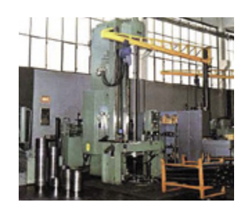
HYDRAULIC AND PNEUMATIC CYLINDERS