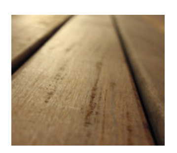
WOOD MILLING MACHINES